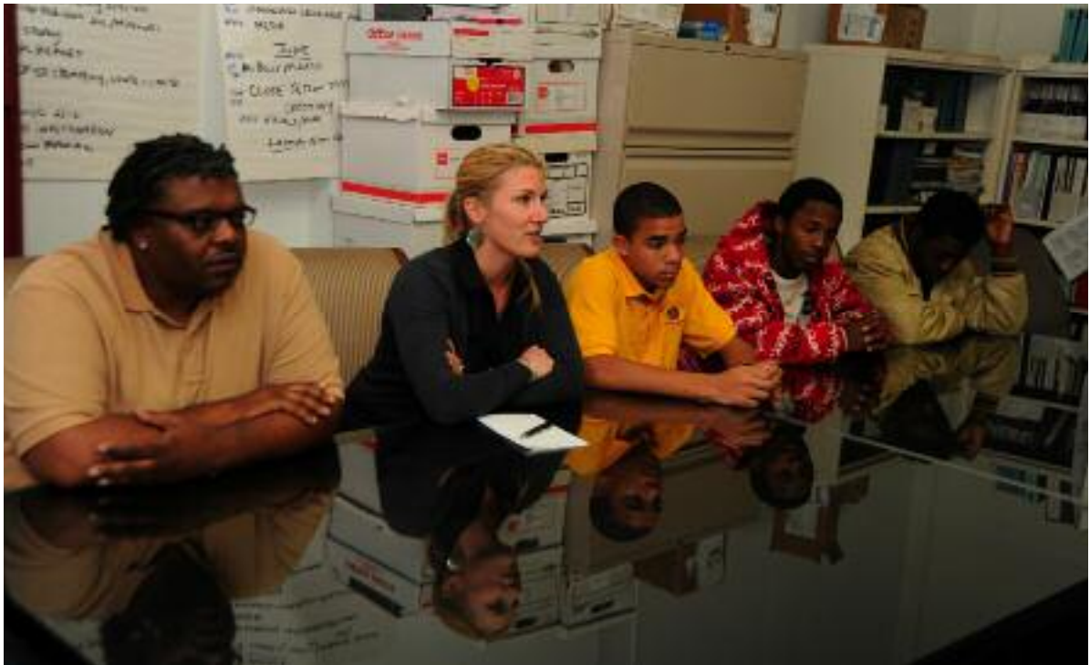
Representatives from Youth Empowerment Project in New Orleans describe their efforts to reform harsh punishment of youth.

men with parenting responsibilities and observant Jews who could not attend the lottery in person on Saturdays.