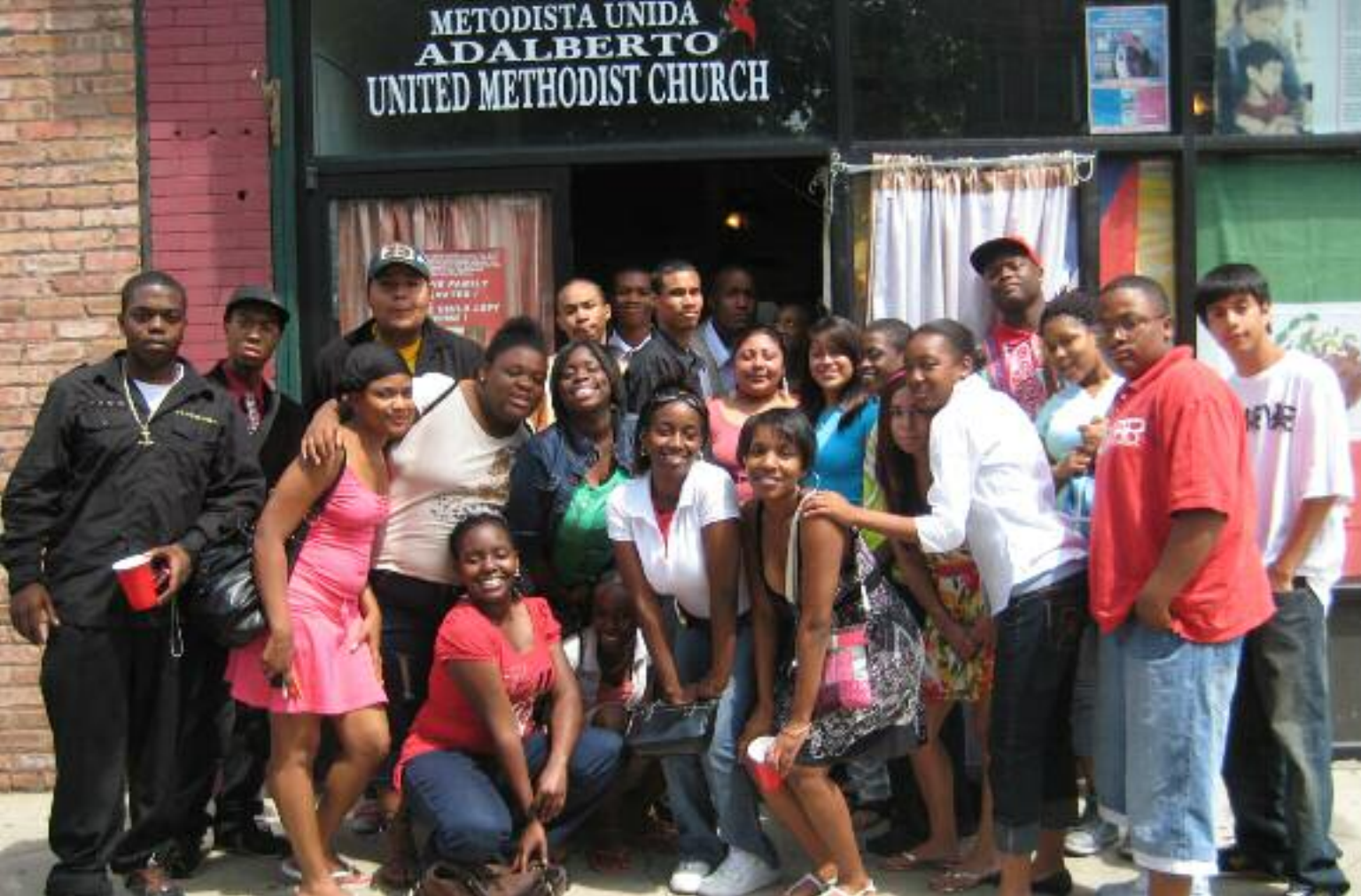
Youth at UCCRO's Intergenerational Grassroots Human Rights Program.

start with, ‘What do we like about our block? What don’t we like? What rights are being violated? What rights should all people have?’ It ends up being the same conversation across communities, with different content,” she noted.